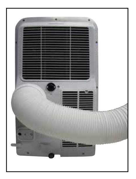
A large diameter, 60" flexible hose effectively exhausts hot air to the outside.

Ease of installing the window adapter is a primary reason the portable unit can be used throughout the house. However, if the portable is being used only for air circulation (fan), it's not necessary to use the hose hook-up.